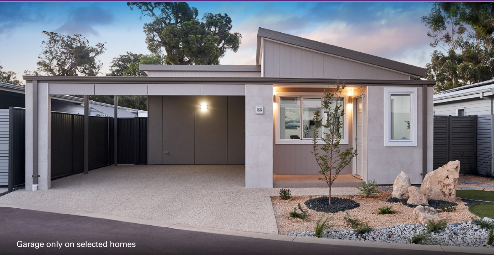
Garage only on selected homes

Providence Lifestyle Henley Brook Resort