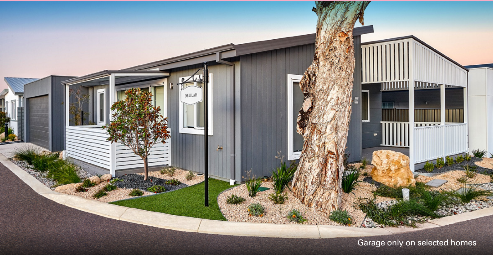
Garage only on selected homes

Providence Lifestyle Henley Brook Resort