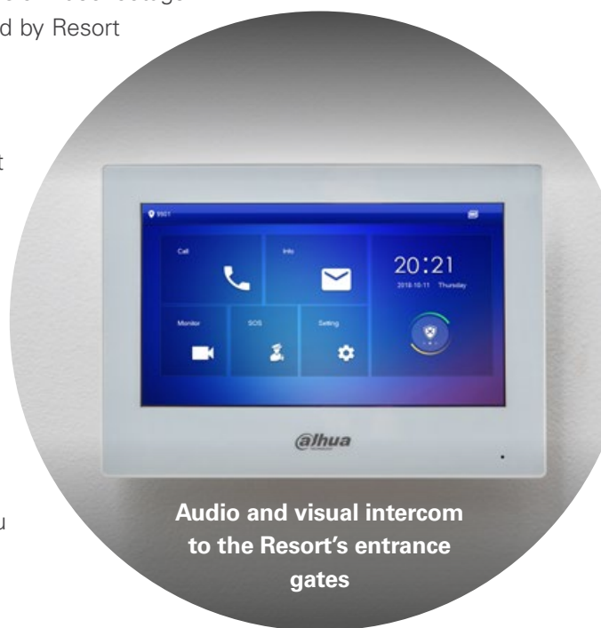
Audio and visual intercom to the Resort's entrance gates