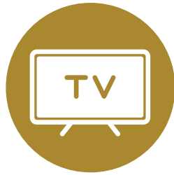
FREE TO AIR TV