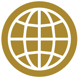
WI-FI & INTERNET